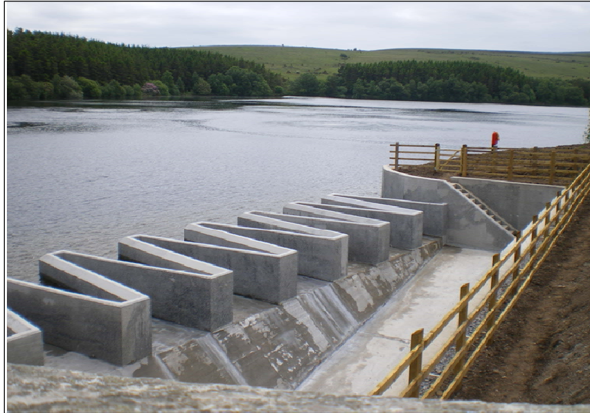
Figure 10. View of Completed Labyrinth Weir and Receiving Channel Viewed from the Dam