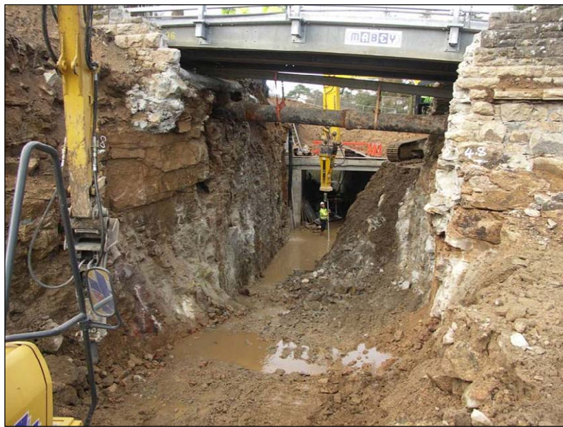
Figure 7. View Looking Downstream through Dam Cut with Temporary Bridge in Position

Further consultations with Dartmoor National Park Authority (DNPA), and a revision to the construction programme by SWW led to a cut and fill option being selected in the final design. A six week road closure period was agreed between SWW and DNPA to allow the works to be completed. As the works were programmed to be undertaken outside the peak tourist seasons the impact on the local economy was minimised. A temporary road bridge was also used to allow limited access for local residents and construction traffic. Figure 7 shows the cut through the dam during construction.