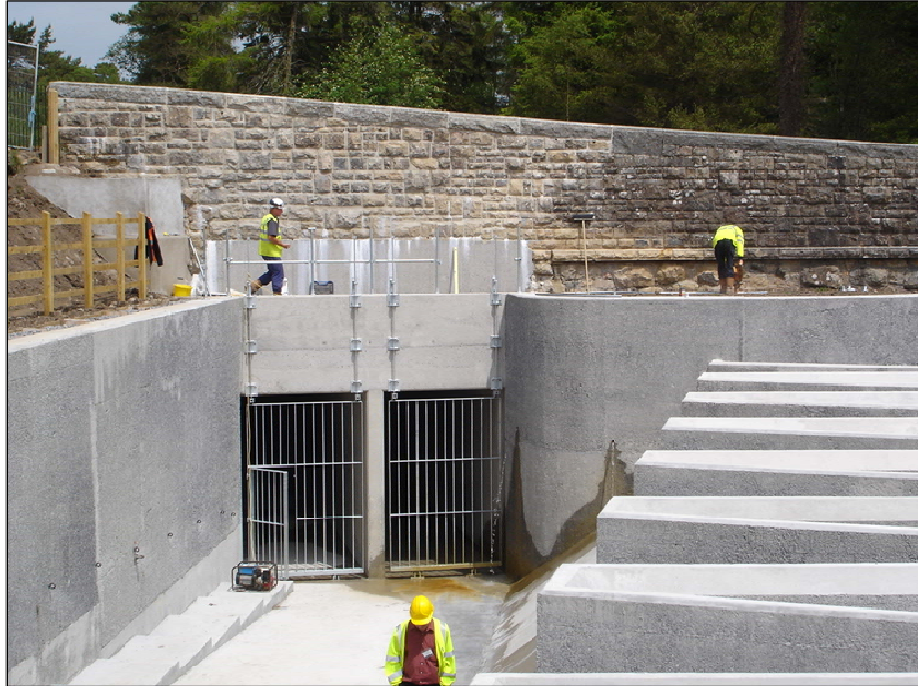
Figure 8. Showing Reinstated Parapet Wall and Near Complete Entrance Works to Buried Culvert

Due to the relatively small scale of the works, and width constraints on the approach road to the dam, it was decided to construct the buried culvert (spillway channel) in situ. As the sides of the excavation were close to vertical it was possible to use the exposed unweathered rock faces as a back shutter, negating the requirement for extensive backfilling. The culvert through the dam was then backfilled with foam concrete to sub base level before reinstating the roadway and parapet walls, see Figure 8 below.