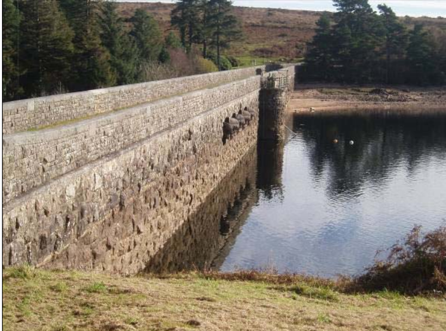
Figure 2. View looking West to East on upstream face of Venford Dam