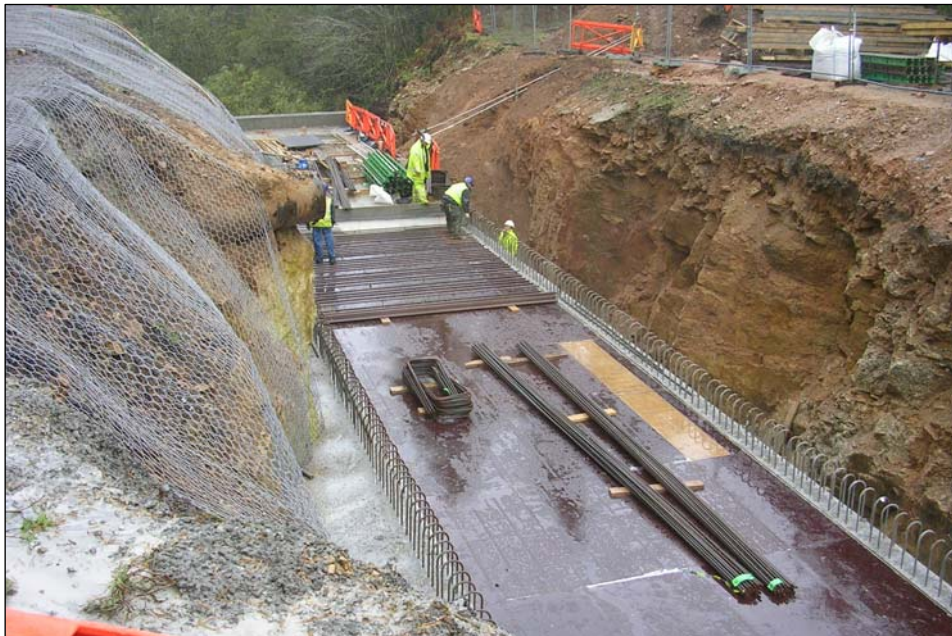
Figure 6. Construction of Buried Culvert in Progress. View looking downstream toward quarry

Open channel options were ruled out on a number of grounds including health and safety, available space and cost. Uncertainty, in the short and long term, of the stability of the excavated unweathered rock faces was a notable deciding factor. The potential safety hazard to operational and inspecting personnel in maintaining an unlined open channel up to 8m deep, together with its proximity to an area of high public amenity, was considered unacceptable. As such a lined buried culvert option was selected in the final design (Figure 6).