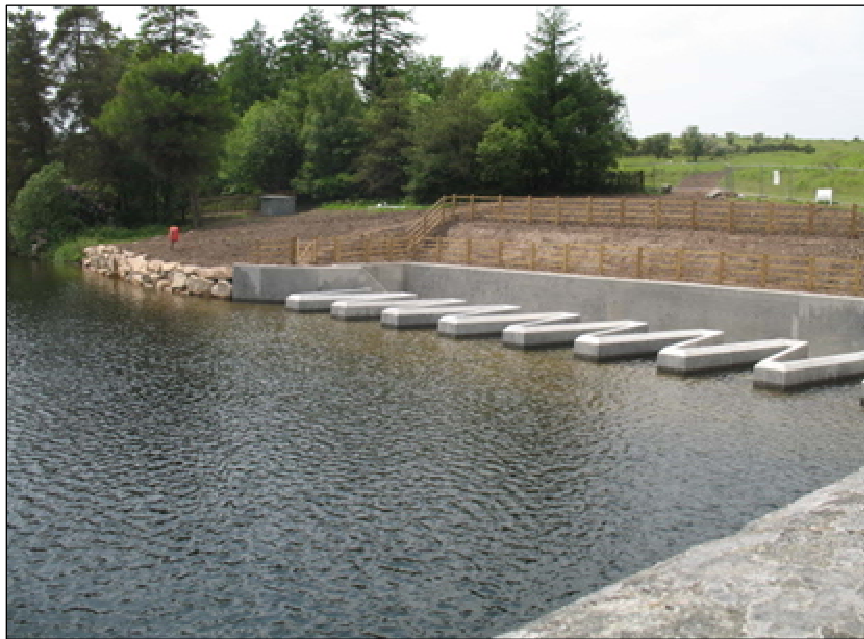
Figure 11. View of Completed Labyrinth Weir and Receiving Channel with Reservoir Level at TWL, viewed from the Dam

The mechanism has been designed to provide a ‘safe’ mode which takes the shear pin out of the collapse mechanism. It is intended that this mode may be adopted during maintenance activities on the screen or during inspections as an added safety measure. Provision has also been made to test the