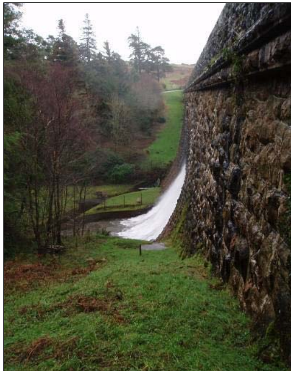
Figure 3. View Looking West to East on downstream face of Venford Dam