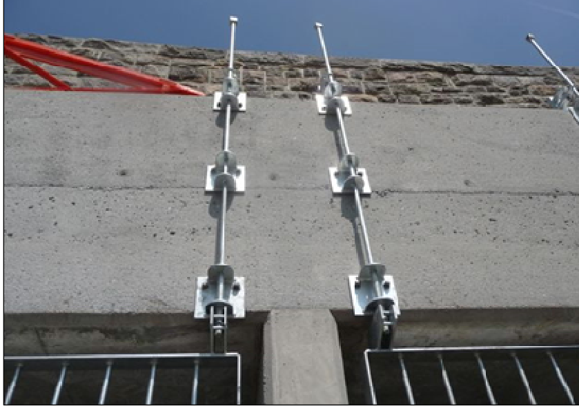
Figure 12. Entrance Safety Screen – Shear Mechanism Under Construction

operation of the screen during statutory inspections by means of a manually operated ratchet winch.