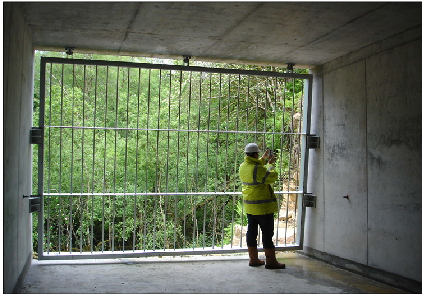
Figure 13. Exit Screen Viewed from Inside the Buried Culvert