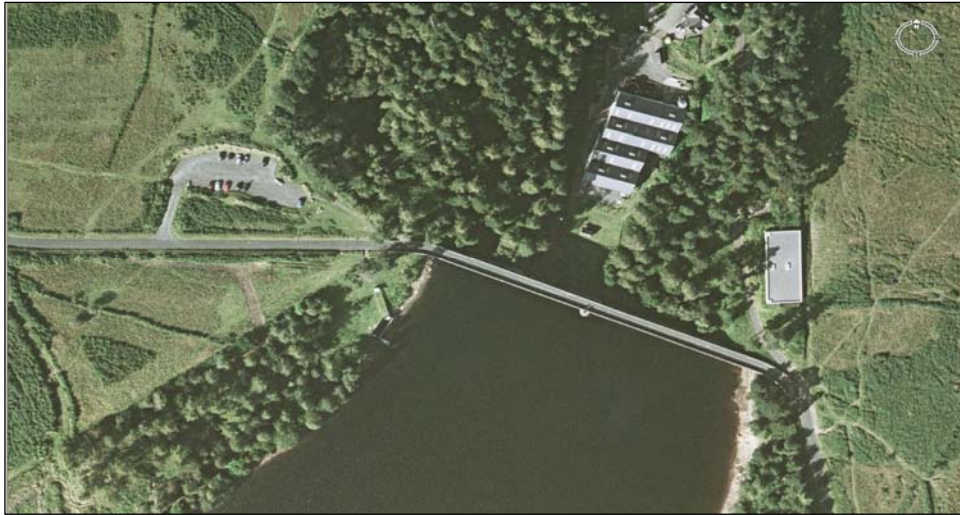
Figure 1. Aerial Image of Venford Dam and Reservoir

‘plum’ core. Four spillway openings allow flood water to safely pass the dam when reservoir TWL is exceeded. Figures 2 & 3 show the upstream and downstream faces of the dam.