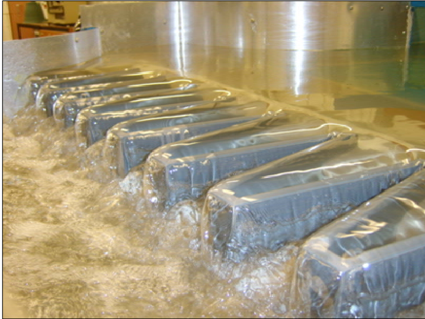
Figure 4. Physical Model of Labyrinth Weir in Operation

proximity of the Undertaker's property boundary, see Figure 1. Two alignments were considered on the west bank as shown in Figure 5.